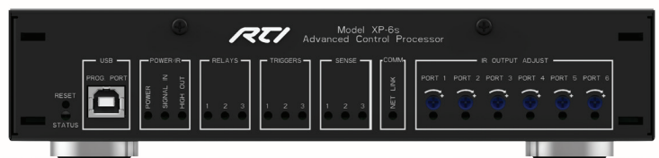
Front view - cover removed