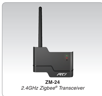
ZM-24 2.4GHz Zigbee® Transceiver