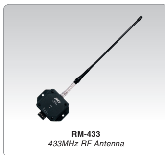
RM-433 433MHz RF Antenna