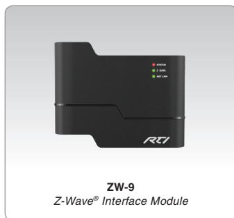
ZW-9 Z-Wave® Interface Module