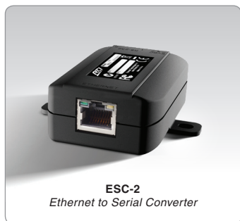
ESC-2 Ethernet to Serial Converter