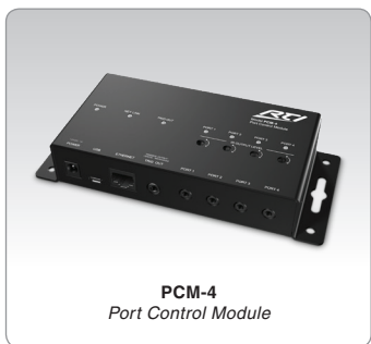
PCM-4 Port Control Module