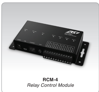
RCM-4 Relay Control Module